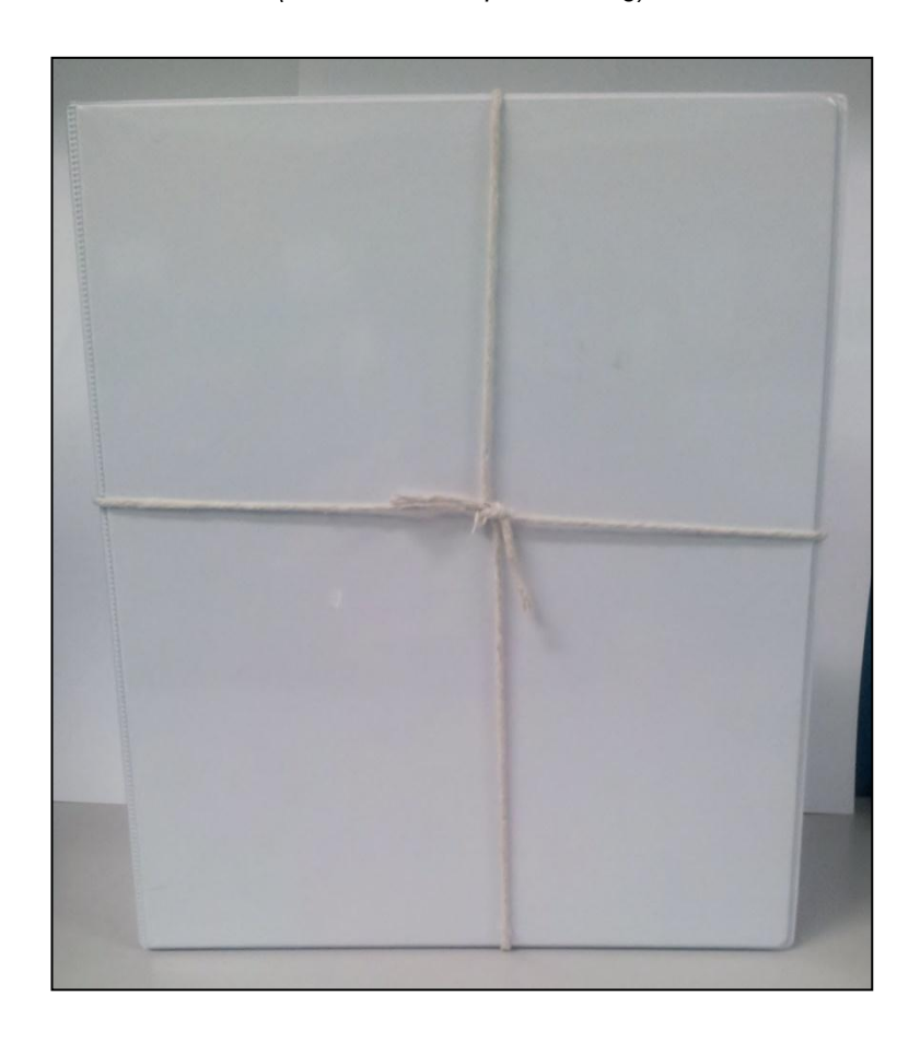
(Exhibit 2: Example of file bound with string)