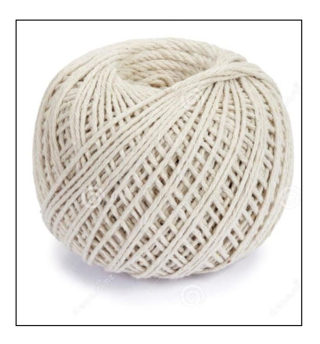
(Exhibit 1: Example of String)