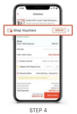
Upon checkout, click on "Shop vouchers" and input your unique voucher code to save RM200!